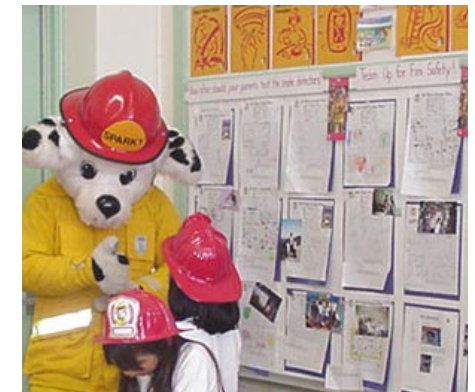
Students show Sparky the Fire Dog® their home fire escape plans.